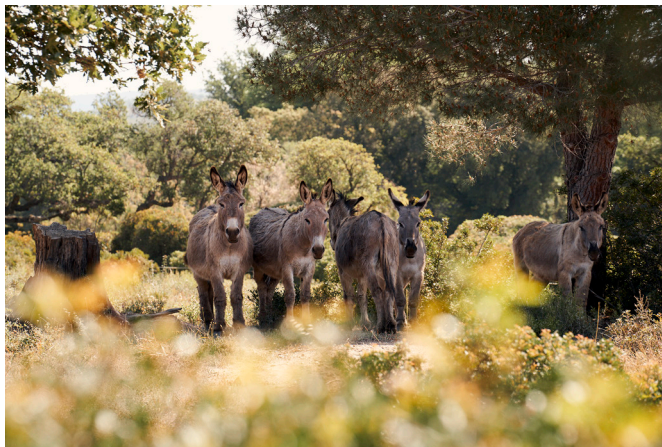
CLOS MIREILLE - PROVENCE CRU CLASSE

The estate produces a white and a rosé, both of which are fresh and expressive, combining fruitiness and tension with a delicate touch of salinity.